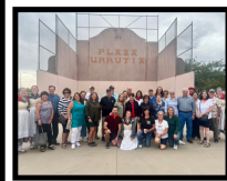
Californians in Colorado