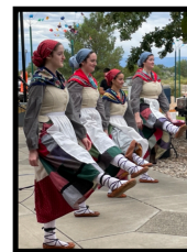
Gauden Bat Dancers